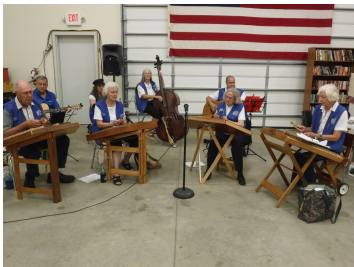
Hanover Historical Museum

It is open to the public. You can find out about workshops and even view tutorials. Meet some of the people in the dulcimer world that you didn't know about. They are all fantastic! LIKE the page and it will pop up each time there is a new post.